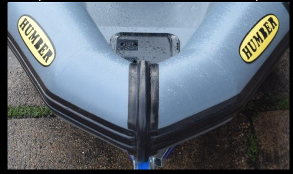
D profile strake verticial at bow