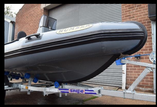
Mini double 'D' outer tube rubbing strake