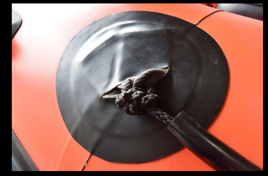
External Life lines mounted on safety line holders