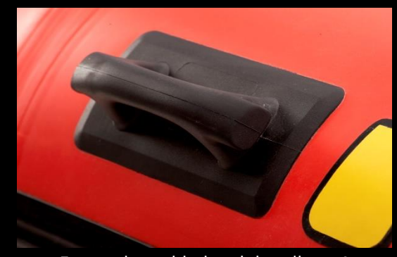
External moulded grab handles x 4 (Positioned at bow and rear of tubes)