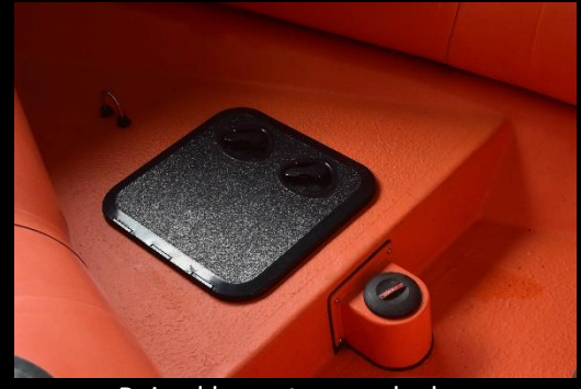
Raised bow stowage locker with two handled access hatch